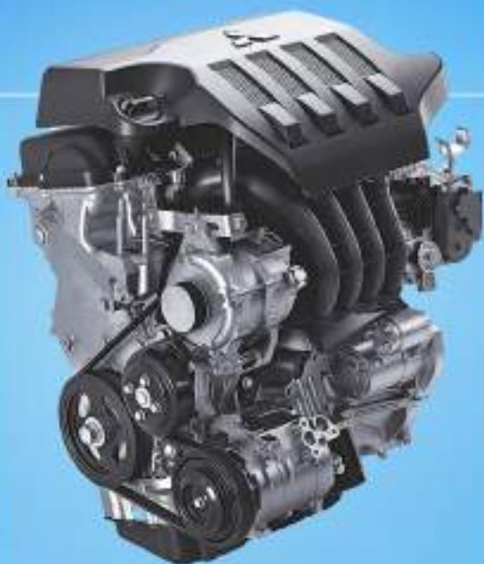
1.5L Engine with MIVEC For a powerful yet efficient drive.