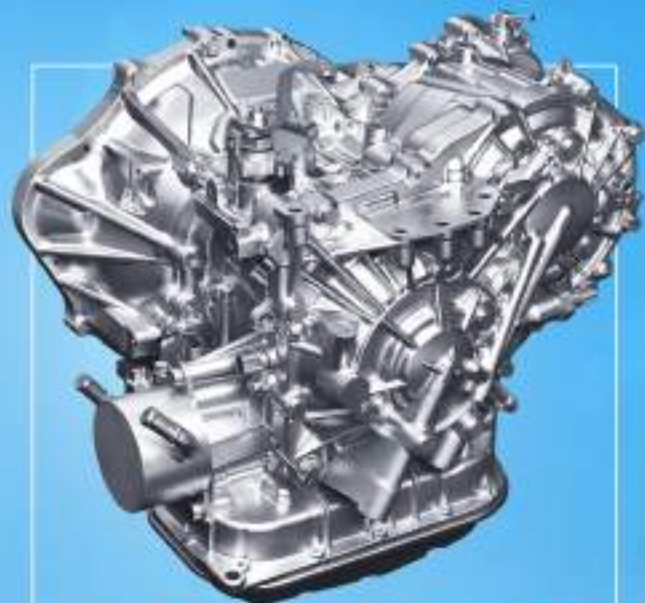
New Continuously Variable Transmission (CVT) For a smooth ride.