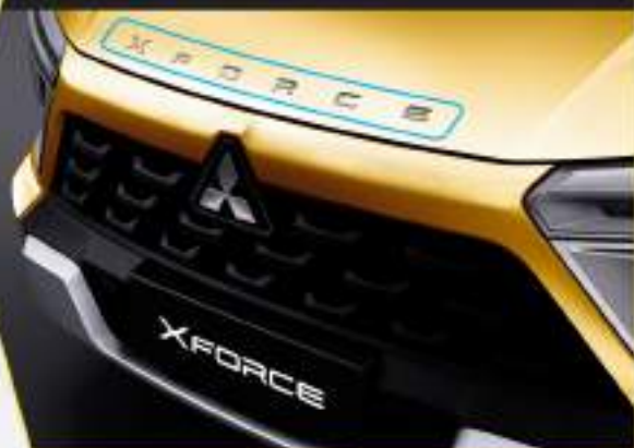
Engine Hood Emblem