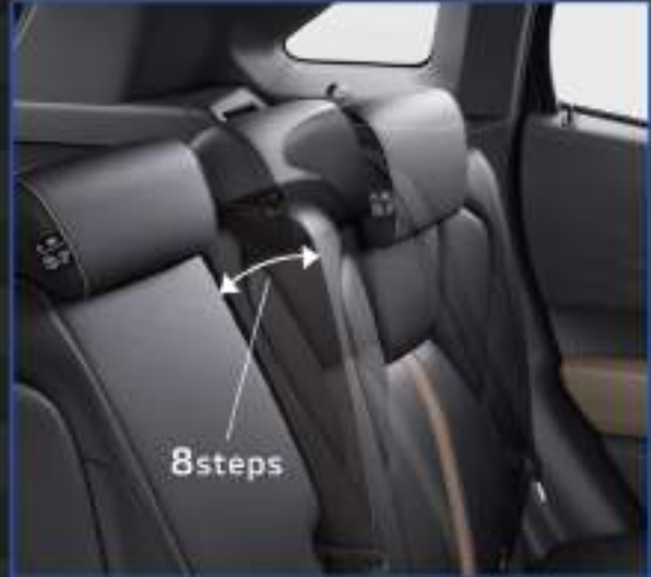
8-Step Reclining Rear Seats