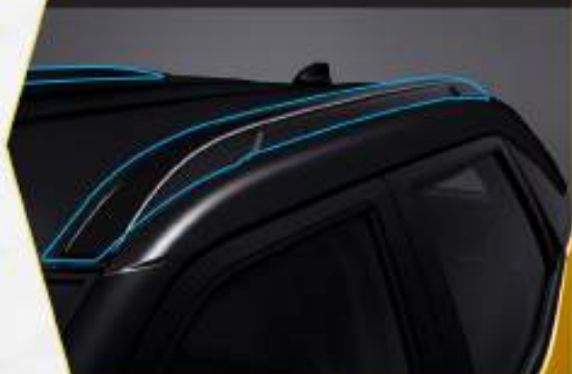
Fashion Roof Rail