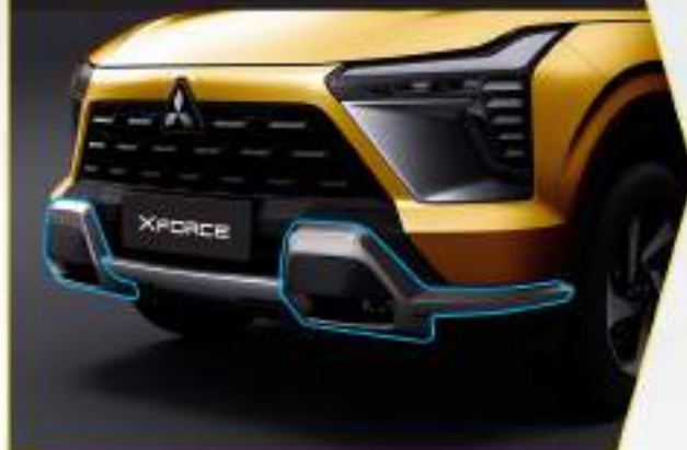
Front Under Garnish